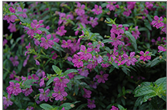
Allyson Mexican Heather flowers

Allyson Mexican Heather is recommended for the following landscape applications;