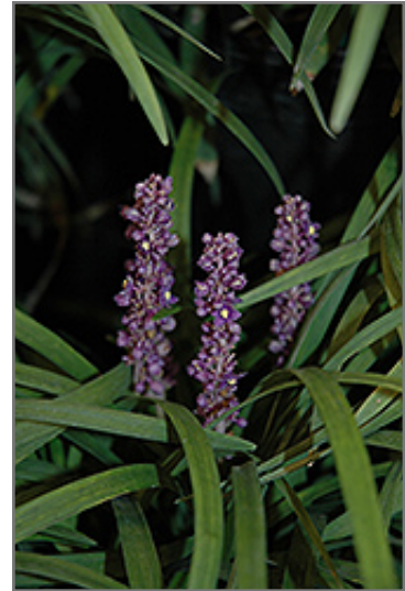
Majestic Lily Turf flowers