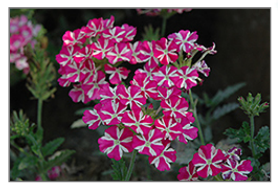
Estrella Pink Star Verbena flowers

Height: 12 inches Spread: 20 inches Spacing: 15 inches Sunlight: O Hardiness Zone: 8b Other Names: Vervain Group/Class: Estrella Series