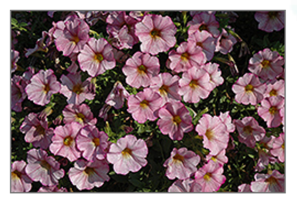
SuperCal Artist Rose Petchoa flowers

SuperCal Artist Rose Petchoa is recommended for the following landscape applications;