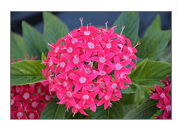
Graffiti OG Rose Star Flower flowers