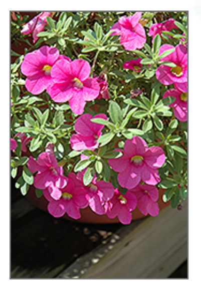
Million Bells Bouquet Pink Calibrachoa flowers

Brightly colored and bold blooms cascade from this compact mounded series with slight trailing tendencies; excellent performance in patio containers, window boxes and hanging baskets; easy to grow, requiring little to no maintenance