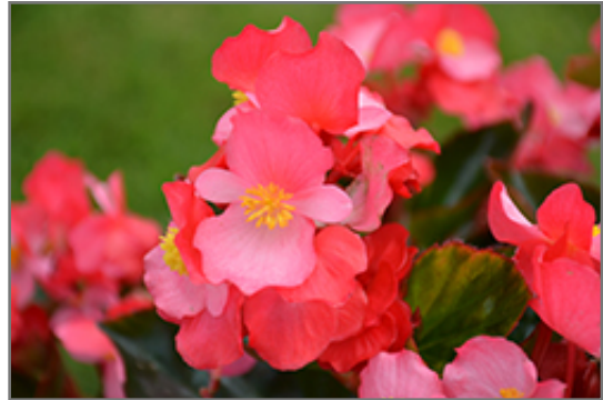
Surefire Rose Begonia flowers

Surefire Rose Begonia is an herbaceous annual with an upright spreading habit of growth. Its medium texture blends into the garden, but can always be balanced by a couple of finer or coarser plants for an effective composition.