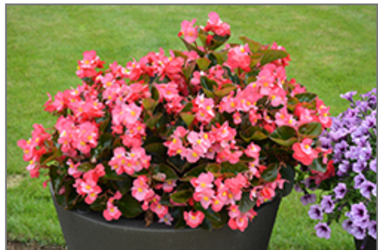
Surefire Rose Begonia in bloom