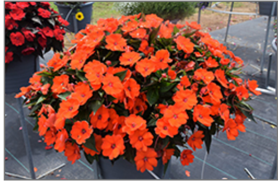
SunPatiens Compact Electric Orange New Guinea Impatiens in bloom

SunPatiens Compact Electric Orange New Guinea Impatiens is a fine choice for the garden, but it is also a good selection for planting in outdoor containers and hanging baskets. It can be used either as 'filler' or as a 'thriller' in the 'spiller-thriller-filler' container combination, depending on the height and form of the other plants used in the container planting. It is even sizeable enough that it can be grown alone in a suitable container. Note that when growing plants in outdoor containers and baskets, they may require more frequent waterings than they would in the yard or garden.