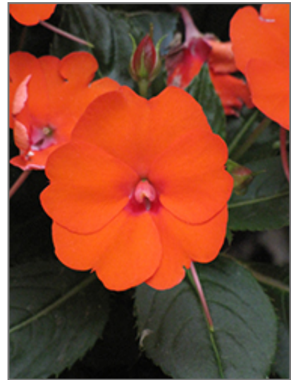
SunPatiens Compact Electric Orange New Guinea Impatiens flowers

This plant will require occasional maintenance and upkeep, and should not require much pruning, except when necessary, such as to remove dieback. It is a good choice for attracting bees and butterflies to your yard. It has no significant negative characteristics.