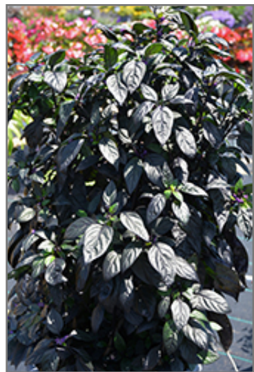
Black Pearl Ornamental Pepper