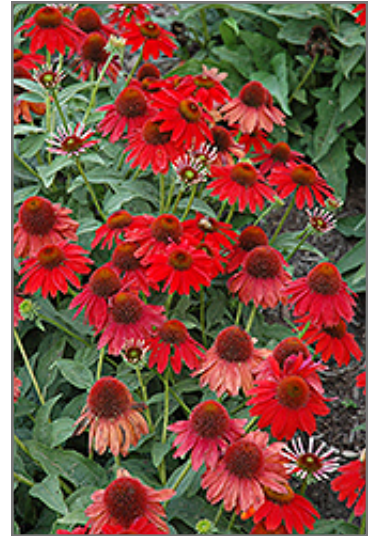
Sombrero Salsa Red Coneflower flowers

This is a relatively low maintenance plant, and is best cleaned up in early spring before it resumes active growth for the season. It is a good choice for attracting butterflies to your yard, but is not particularly attractive to deer who tend to leave it alone in favor of tastier treats. It has no significant negative characteristics.