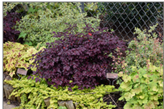
Crimson Fire Chinese Fringeflower