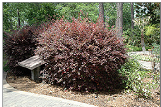
Daruma Chinese Fringeflower