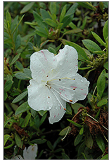
Encore Autumn Starlite Azalea flowers