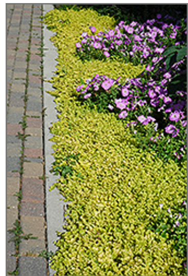
Golden Creeping Jenny