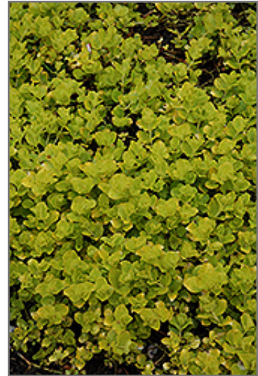
Golden Creeping Jenny foliage

Golden Creeping Jenny is recommended for the following landscape applications;