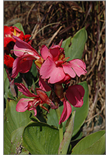
Tropical Rose Canna flowers

This plant should only be grown in full sunlight. It requires an evenly moist well-drained soil for optimal growth, but will die in standing water. It is not particular as to soil pH, but grows best in rich soils. It is highly tolerant of urban pollution and will even thrive in inner city environments, and will benefit from being planted in a relatively sheltered location. Consider applying a thick mulch around the root zone in winter to protect it in exposed locations or colder microclimates. This particular variety is an interspecific hybrid. It can be propagated by division; however, as a cultivated variety, be aware that it may be subject to certain restrictions or prohibitions on propagation.