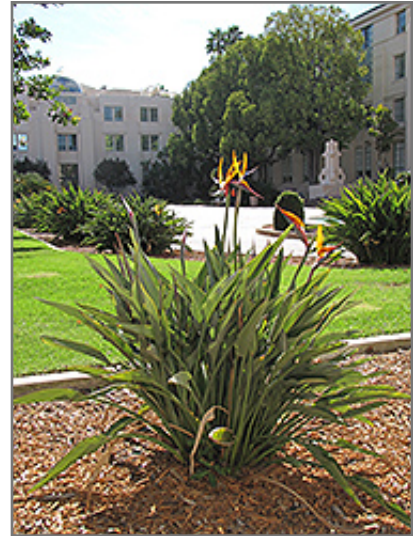
Orange Bird Of Paradise in bloom

Orange Bird Of Paradise is a fine choice for the garden, but it is also a good selection for planting in outdoor pots and containers. With its upright habit of growth, it is best suited for use as a 'thriller' in the 'spiller-thriller-filler' container combination; plant it near the center of the pot, surrounded by smaller plants and those that spill over the edges. It is even sizeable enough that it can be grown alone in a suitable container. Note that when growing plants in outdoor containers and baskets, they may require more frequent waterings than they would in the yard or garden.