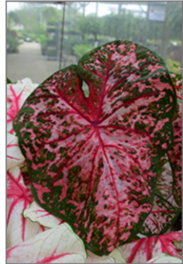
Carolyn Whorton Caladium foliage

Carolyn Whorton Caladium is recommended for the following landscape applications;