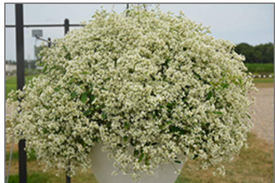
Stardust Super Flash Euphorbia in bloom