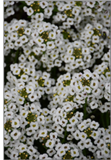
Stream White Sweet Alyssum flowers

Stream White Sweet Alyssum is recommended for the following landscape applications;