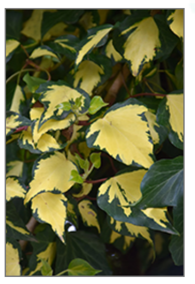
Gold Heart Ivy foliage