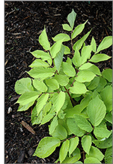
Sun King Japanese Spikenard foliage

This plant performs well in both full sun and full shade. It prefers to grow in average to moist conditions, and shouldn't be allowed to dry out. It is not particular as to soil type or pH. It is highly tolerant of urban pollution and will even thrive in inner city environments. This is a selected variety of a species not originally from North America.