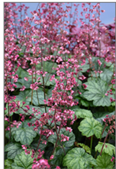
Berry Timeless Coral Bells flowers