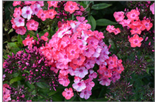
Garden Girls Glamour Girl Garden Phlox flowers

Garden Girls Glamour Girl Garden Phlox is recommended for the following landscape applications;