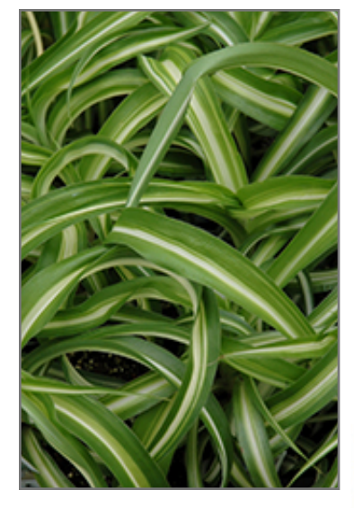
Variegated Spider Plant foliage

Variegated Spider Plant is recommended for the following landscape applications;