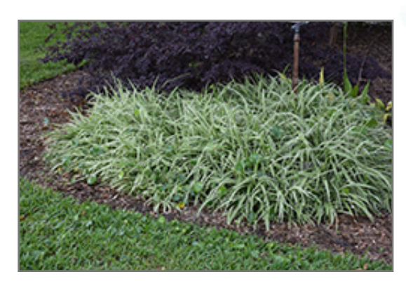
Variegated Spider Plant

Probably the most cultivated houseplant in the world, this variety is grown primarily for its interesting foliage; great for containers, or cascading from hanging baskets; tolerates drought and deep shade, but perfers bright indirect sun