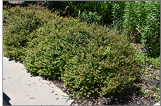
Rose Creek Abelia

Rose Creek Abelia will grow to be about 4 feet tall at maturity, with a spread of 5 feet. It tends to fill out right to the ground and therefore doesn't necessarily require facer plants in front. It grows at a slow rate, and under ideal conditions can be expected to live for approximately 30 years.