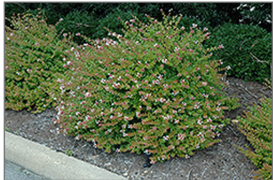
Rose Creek Abelia in bloom

This shrub will require occasional maintenance and upkeep, and should only be pruned after flowering to avoid removing any of the current season's flowers. It is a good choice for attracting birds, bees and butterflies to your yard, but is not particularly attractive to deer who tend to leave it alone in favor of tastier treats. It has no significant negative characteristics.