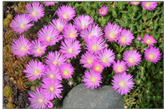
Table Mountain Ice Plant flowers

Table Mountain Ice Plant is recommended for the following landscape applications;