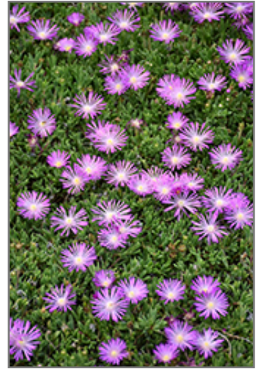
Table Mountain Ice Plant flowers

Table Mountain Ice Plant is a fine choice for the garden, but it is also a good selection for planting in outdoor pots and containers. Because of its spreading habit of growth, it is ideally suited for use as a 'spiller' in the 'spiller-thriller-filler' container combination; plant it near the edges where it can spill gracefully over the pot. Note that when growing plants in outdoor containers and baskets, they may require more frequent waterings than they would in the yard or garden.