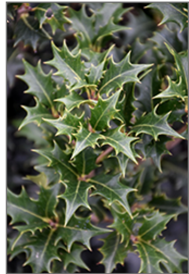
Gulftide False Holly foliage