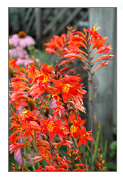
Prince Of Orange Crocosmia flowers

Prince Of Orange Crocosmia is an herbaceous perennial with an upright spreading habit of growth. Its medium texture blends into the garden, but can always be balanced by a couple of finer or coarser plants for an effective composition.