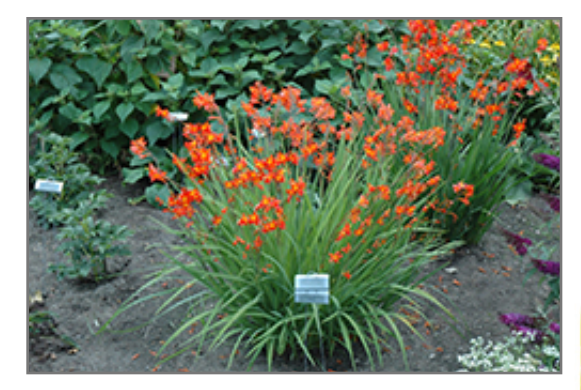
Prince Of Orange Crocosmia in bloom

This is a relatively low maintenance plant, and should be cut back in late fall in preparation for winter. It is a good choice for attracting bees, butterflies and hummingbirds to your yard, but is not particularly attractive to deer who tend to leave it alone in favor of tastier treats. It has no significant negative characteristics.