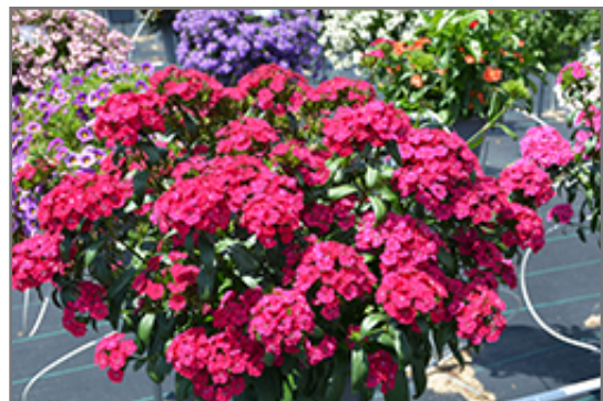
Jolt Cherry Hybrid Pinks in bloom