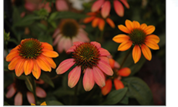
Spice Fest Coneflower flowers