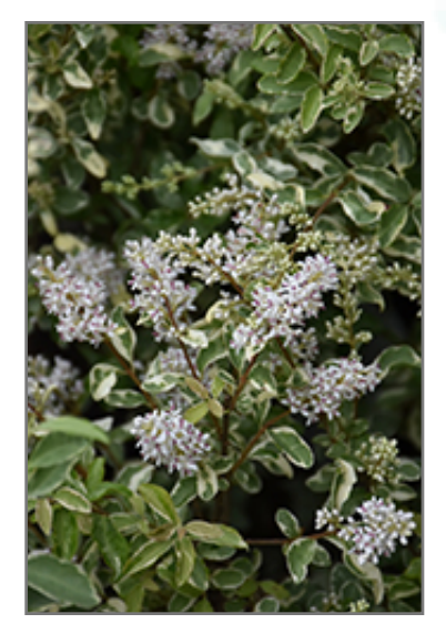
Swift Creek Privet flowers