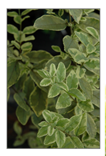
Swift Creek Privet foliage