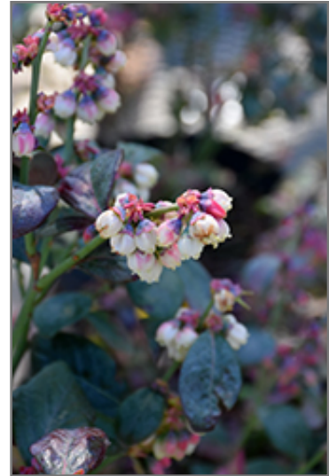
Pink Icing Blueberry flowers

This shrub is quite ornamental as well as edible, and is as much at home in a landscape or flower garden as it is in a designated edibles garden. It does best in full sun to partial shade. It does best in average to evenly moist conditions, but will not tolerate standing water. It is very fussy about its soil conditions and must have sandy, acidic soils to ensure success, and is subject to chlorosis (yellowing) of the foliage in alkaline soils. It is quite intolerant of urban pollution, therefore inner city or urban streetside plantings are best avoided, and will benefit from being planted in a relatively sheltered location. Consider applying a thick mulch around the root zone in winter to protect it in exposed locations or colder microclimates. This particular variety is an interspecific hybrid.