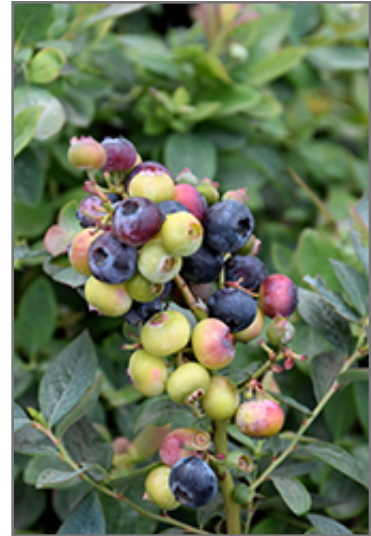
Pink Icing Blueberry fruit

Pink Icing Blueberry features dainty clusters of white bell-shaped flowers with shell pink overtones hanging below the branches in mid spring, which emerge from distinctive pink flower buds. It has bluish-green deciduous foliage which emerges pink in spring. The glossy oval leaves turn an outstanding aqua bluish-green in the fall. It features an abundance of magnificent blue berries in mid summer.