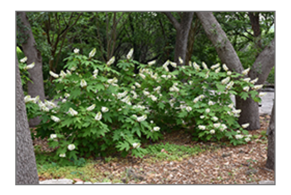
Oakleaf Hydrangea in bloom