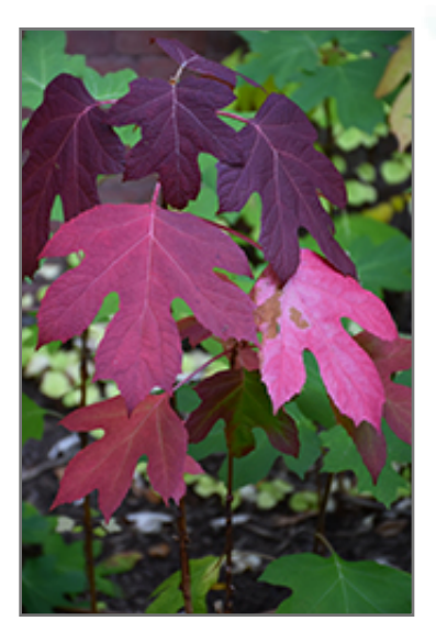
Oakleaf Hydrangea in fall

This shrub performs well in both full sun and full shade. It prefers to grow in average to moist conditions, and shouldn't be allowed to dry out. It is not particular as to soil type or pH. It is somewhat tolerant of urban pollution, and will benefit from being planted in a relatively sheltered location. Consider applying a thick mulch around the root zone in winter to protect it in exposed locations or colder microclimates. This species is native to parts of North America.