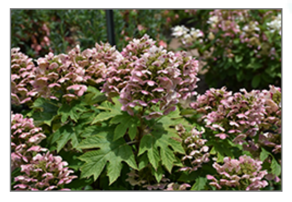
Oakleaf Hydrangea flowers (faded)

Oakleaf Hydrangea is recommended for the following landscape applications;