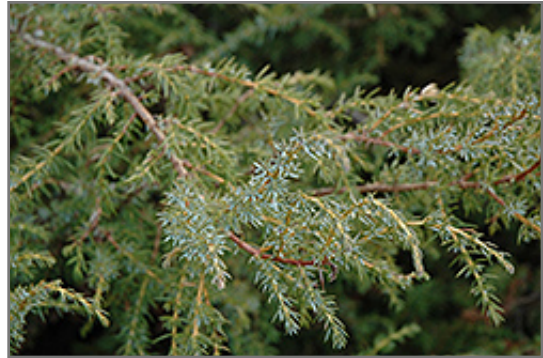
Common Juniper foliage