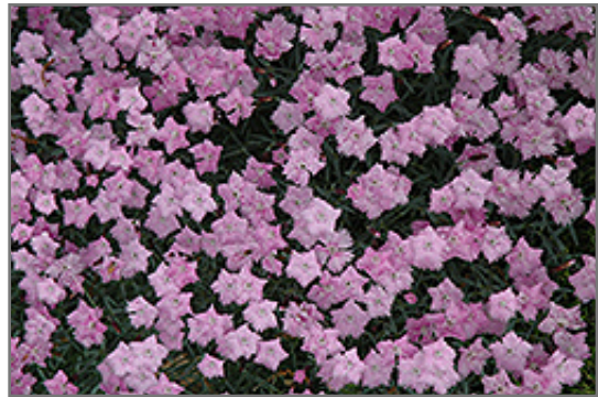
Bath's Pink Pinks in bloom

Bath's Pink Pinks is recommended for the following landscape applications;