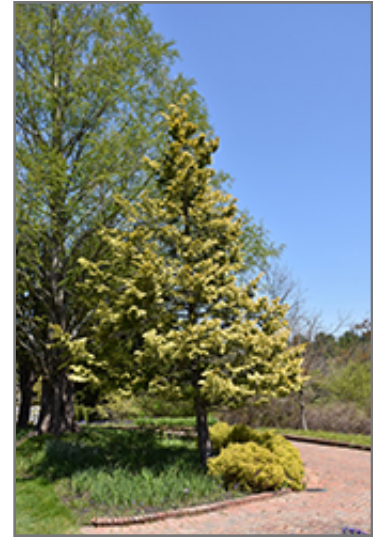
Cripps Gold Falsecypress

This tree does best in full sun to partial shade. It prefers to grow in average to moist conditions, and shouldn't be allowed to dry out. It is not particular as to soil type or pH. It is highly tolerant of urban pollution and will even thrive in inner city environments, and will benefit from being planted in a relatively sheltered location. Consider applying a thick mulch around the root zone in winter to protect it in exposed locations or colder microclimates. This is a selected variety of a species not originally from North America.