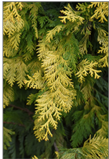
Cripps Gold Falsecypress foliage