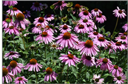
Magnus Coneflower flowers