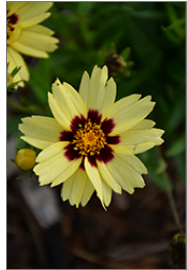
UpTick Cream and Red Tickseed flowers

UpTick Cream and Red Tickseed is recommended for the following landscape applications;