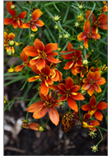
Sizzle And Spice Crazy Cayenne Tickseed flowers

Sizzle And Spice Crazy Cayenne Tickseed is recommended for the following landscape applications;