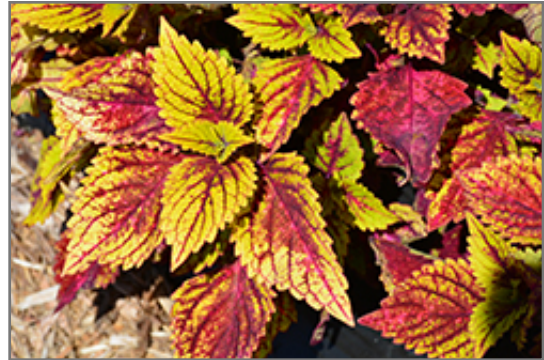
Color Clouds Hottie Coleus foliage

Color Clouds Hottie Coleus is recommended for the following landscape applications;