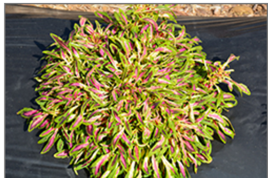
Fancy Feathers Pink Coleus