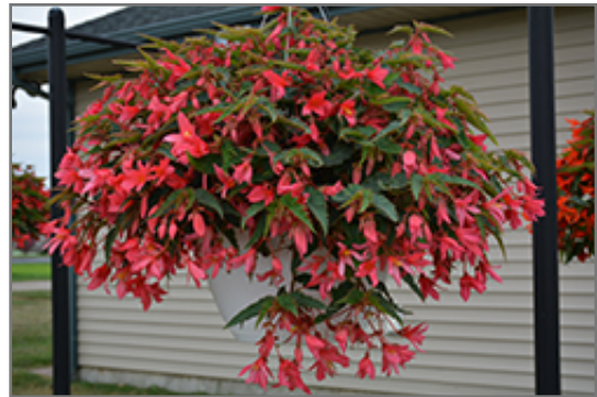
Bossa Nova Pink Glow Begonia in bloom

Bossa Nova Pink Glow Begonia is a fine choice for the garden, but it is also a good selection for planting in outdoor containers and hanging baskets. Because of its trailing habit of growth, it is ideally suited for use as a 'spiller' in the 'spiller-thriller-filler' container combination; plant it near the edges where it can spill gracefully over the pot. Note that when growing plants in outdoor containers and baskets, they may require more frequent waterings than they would in the yard or garden.