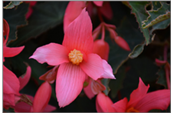
Bossa Nova Pink Glow Begonia flowers

This is a high maintenance plant that will require regular care and upkeep, and usually looks its best without pruning, although it will tolerate pruning. Deer don't particularly care for this plant and will usually leave it alone in favor of tastier treats. Gardeners should be aware of the following characteristic(s) that may warrant special consideration;