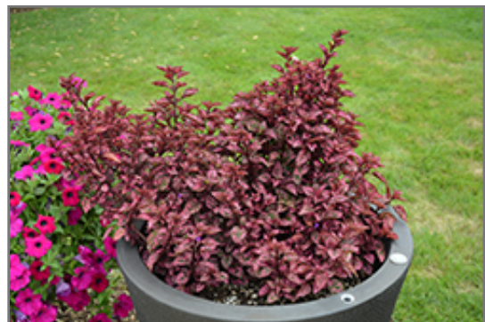
Hippo Rose Polka Dot Plant