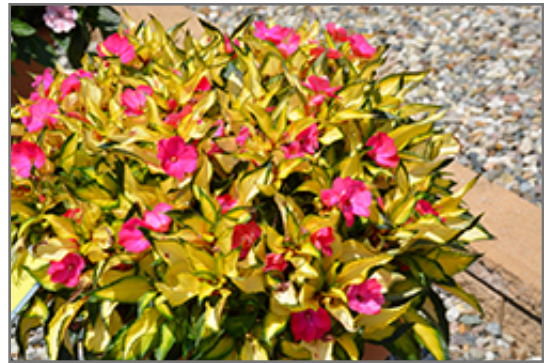
SunPatiens Compact Tropical Rose New Guinea Impatiens in bloom