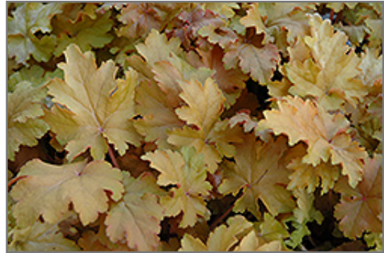
Amber Waves Coral Bells foliage

Amber Waves Coral Bells is a fine choice for the garden, but it is also a good selection for planting in outdoor pots and containers. It is often used as a 'filler' in the 'spiller-thriller-filler' container combination, providing a mass of flowers and foliage against which the larger thriller plants stand out. Note that when growing plants in outdoor containers and baskets, they may require more frequent waterings than they would in the yard or garden.