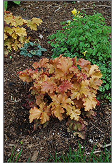
Amber Waves Coral Bells

This is a relatively low maintenance plant, and should be cut back in late fall in preparation for winter. It is a good choice for attracting hummingbirds to your yard. It has no significant negative characteristics.