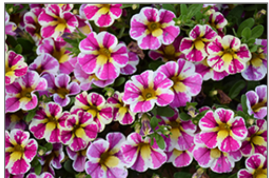
Candy Shop Fancy Berry Calibrachoa flowers