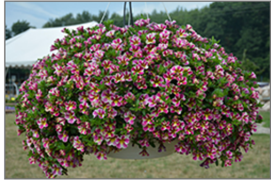
Candy Shop Fancy Berry Calibrachoa in bloom