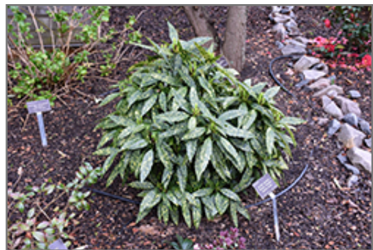
Hosoba Hoshifu Aucuba