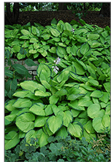
Gold Standard Hosta in bloom