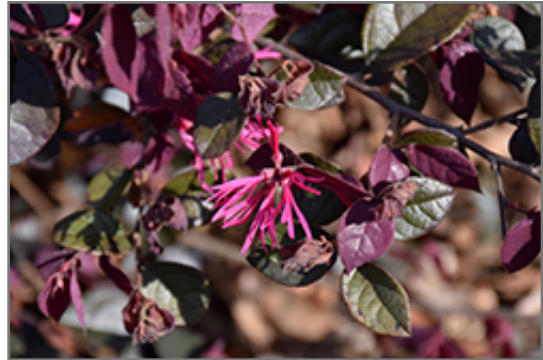
Jazz Hands Bold Fringeflower flowers