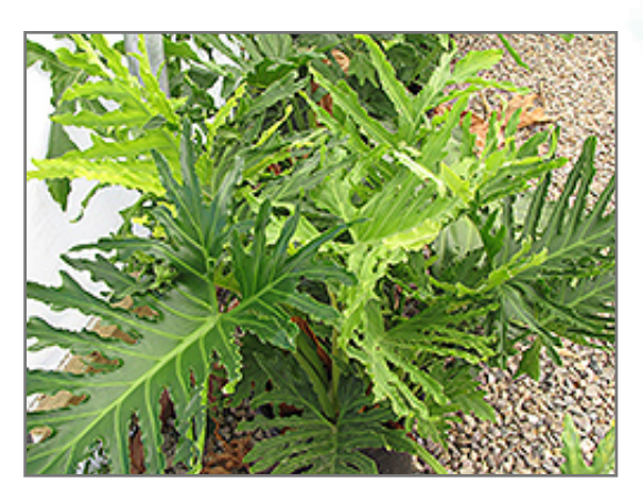
Hope Philodendron foliage

This plant is native to the tropics and prefers growing in moist environments with evenly warm conditions all year round. In our climate, it is usually grown as an outdoor annual in the garden or in a container. If you want it to survive the winter, it can be brought in to the house and provided with special care, and then returned to the garden the following season. In its preferred tropical habitat, it can grow to be around 4 feet tall at maturity, with a spread of 4 feet. However, when grown as an annual or when overwintered indoors, it can be expected to perform differently, and its exact height and spread will depend on many factors; you may wish to consult with our experts as to how it might perform in your specific application and growing conditions.