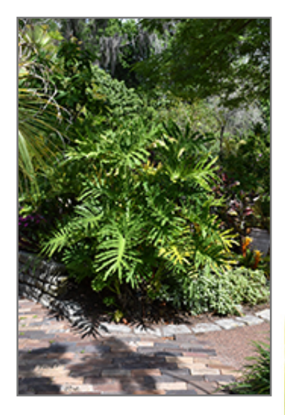
Hope Philodendron